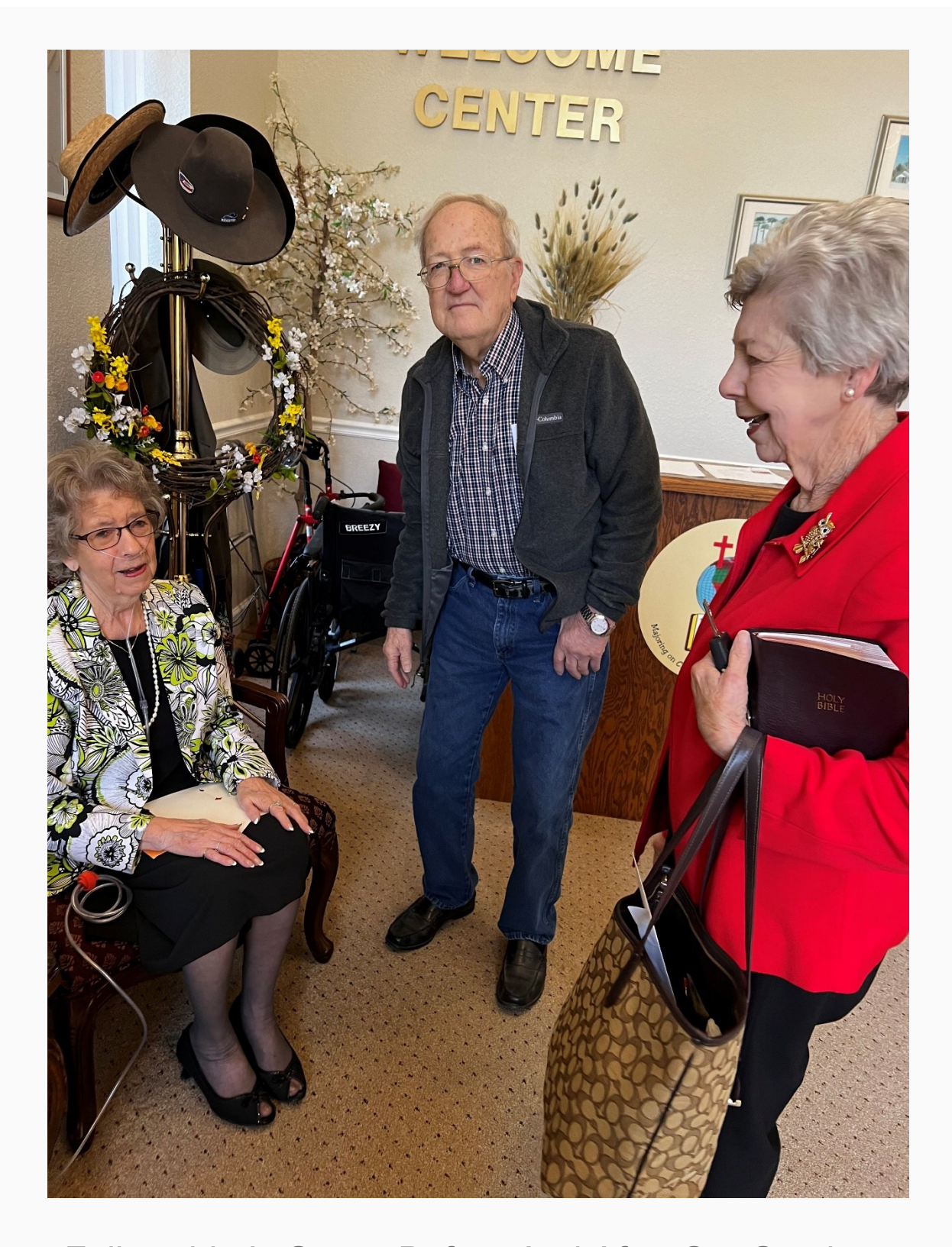
Fellowship Is Sweet Before And After Our Services